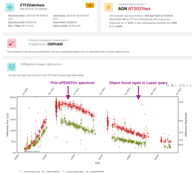
Screenshot from the Lasair page for AT2021lwx/ZTF20abrbeie