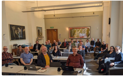
The LUSC team in the Haldane Room at UCL

Phase B of the LUSC funding started in July 2019 and since then the LUSC all-team meetings have taken place regularly online, usually every quarter. The original intention, however, had been for every other LUSC all-team meeting to be in-person but ... COVID-19 obviously had other ideas.